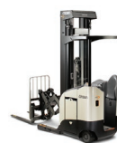
RR/RD 5700 series Double deep reach truck 1.6 / 2.0 tonne