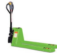
Electric pallet truck 2.0 tonne