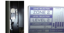
Rack height location assist