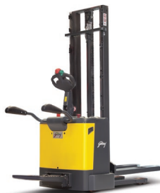
Electric stacker 1.2 tonne