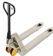
PTH 50 series hand pallet truck 2.3 tonne