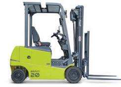
Bravo 4 wheel electric forklift 1.5 / 2.0 tonne