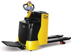
Powered pallet truck 2.0 tonne