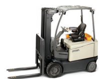
FC 5700 electric forklift 2.0 / 3.0 tonne