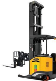
Double deep reach truck 1.5 tonne