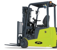
Bravo 3 wheel electric forklift 1.6 / 2.0 tonne