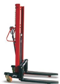
Manual stacker 1 tonne