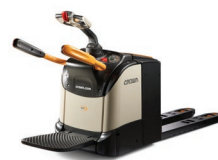
WT 3000 rider powered pallet truck 2.0 / 2.5 tonne