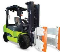
Paper roll clamp