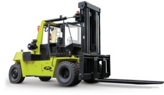
G Series Diesel forklift 16.0 tonne