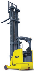
Pro series reach truck 1.2 / 1.4 / 1.6 / 1.8 / 2.0 tonne