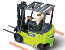
Red halo safety light