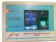
All-in-one access control