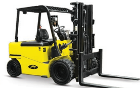
Bravo 4 wheel electric forklift 5.0 tonne