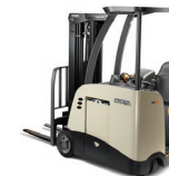
RC 5700 series electric forklift 1.4 / 1.6 / 1.8 tonne