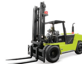
Heavy diesel forklift 12.0 tonne