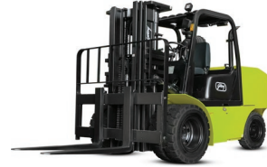
GX series diesel forklift 5 tonne SB & XB