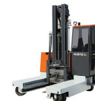
Side loader MQ series up to 35 tonne