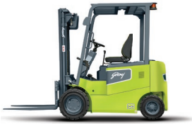
Lithium-ion forklift 2.0 / 3.0 tonne