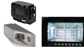
AI camera with pedestrian detection system