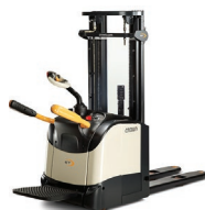
ES/ET 4000 series electric stacker 1.2 / 1.4 / 1.6 tonne