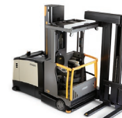
TSP 1000 / 1500 series turret stock picker 1.0 / 1.25 / 1.5 tonne