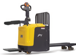
Powered pallet truck 3.0 tonne