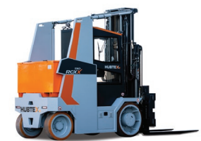
Compact heavy electric forklift up to 30 tonne