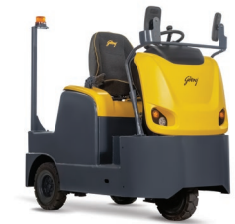
Tow trucks 5 & 6 tonne