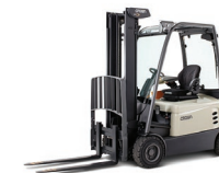
SC 6000 series electric forklift 1.4 / 1.8 / 2.0 tonne