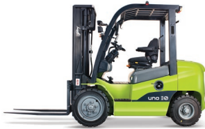
Uno series diesel forklift 1.5 / 2.0 / 2.5 / 3.0 tonne