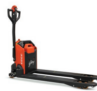
Edge powered hand pallet truck 1.5 tonne