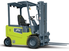
Uno series electric forklift 1.5 / 2.0 / 2.5 / 3.0 tonne