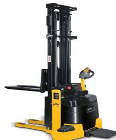
Electric stacker 1.5 tonne