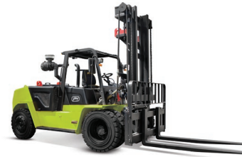
G series diesel forklift 8.0 / 10.0 tonne