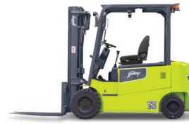
Neo series electric forklift 1.5 / 2.0 / 2.5 / 3.0 tonne