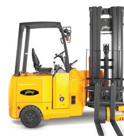
Articulated forklift 1.4 / 1.8 / 2.0 tonne