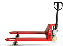
Hand pallet truck 2.5 tonne